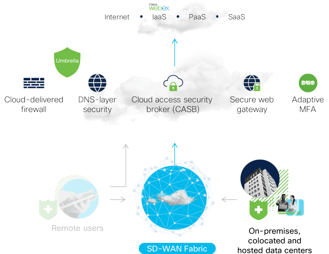
Figure 3: Cisco SD-WAN enabled branch architecture.

Automate deployment of cloud security across your SD-WAN fabric to thousands of branches and instantly begin protecting against threats. Secure and connect users over any transport to any cloud with a simple and intuitive onboarding to SASE. Cisco SD-WAN delivers automated tunneling through one-click, full-mesh VPN between all branch locations so you can scale up or down with ease. End-to-end security segmentation honors enterprise intent and provides branches with secure connectivity to everything they need: from on-premises and colocated facilities to integrated cloud services ranging from AWS to Azure, and more.